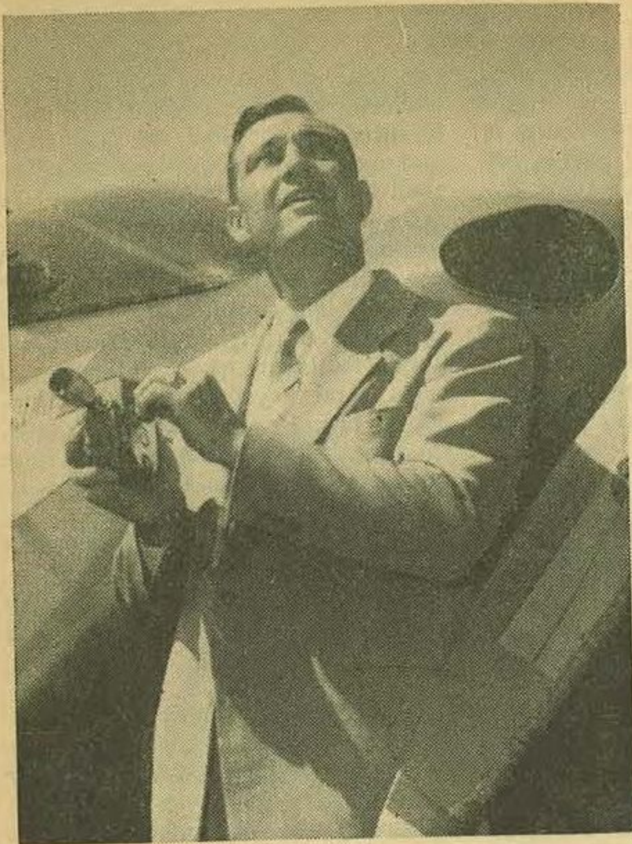
"I'll never go into the air again without a camera!" declares Kenneth Arnold standing beside his plane the day after observing a train of nine mysterious flying disks.